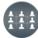
9-way Integrated MCU