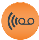
Recording and Streaming