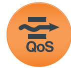
Bandwidth & QoS Management