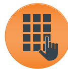
Video Telephony Services