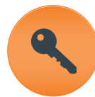
Management and Administration