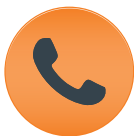
SIP & H.323 Control